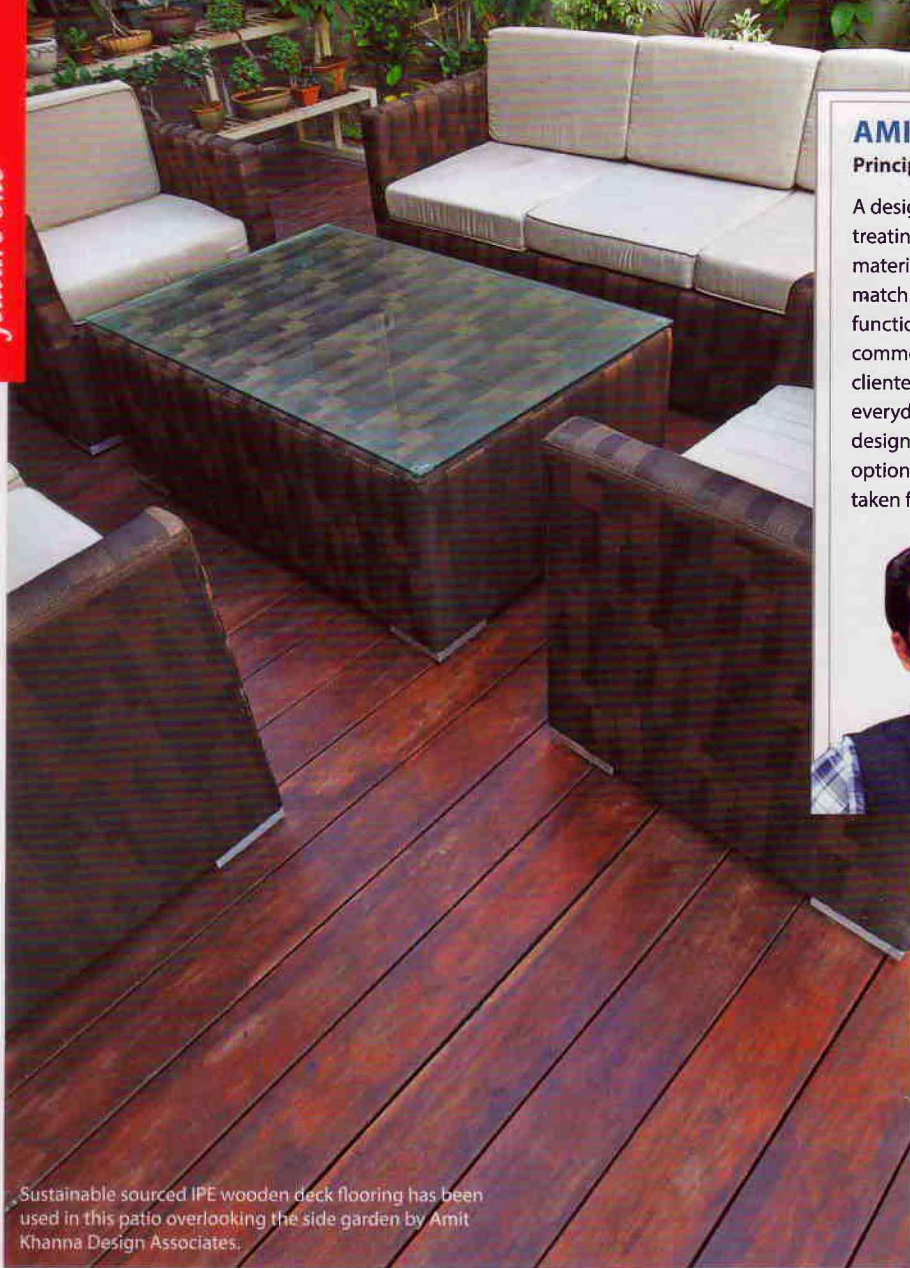
Sustainable sourced IPE wooden deck flooring has been used in this patio overlooking the side garden by Amit Khanna Design Associates.