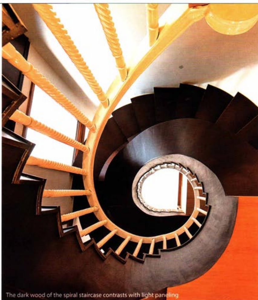
The dark wood of the spiral staircase contrasts with light paneling