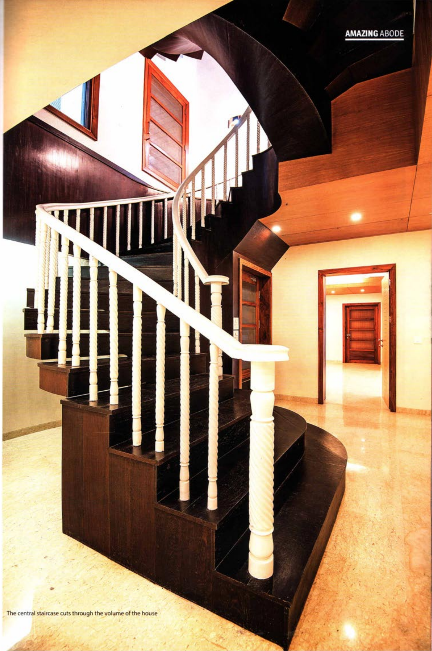
The central staircase cuts through the volume of the house