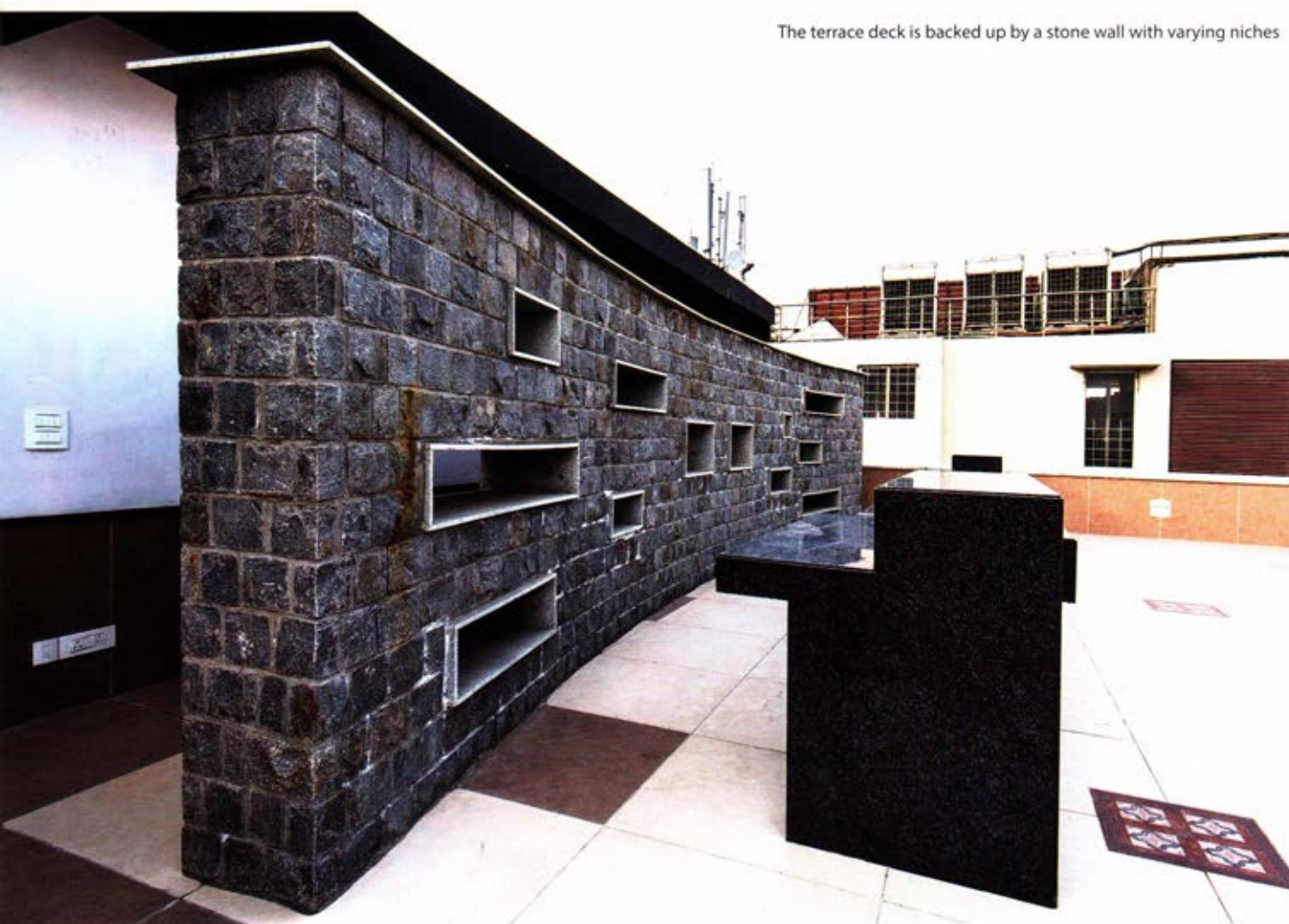
The terrace deck is backed up by a stone wall with varying niches