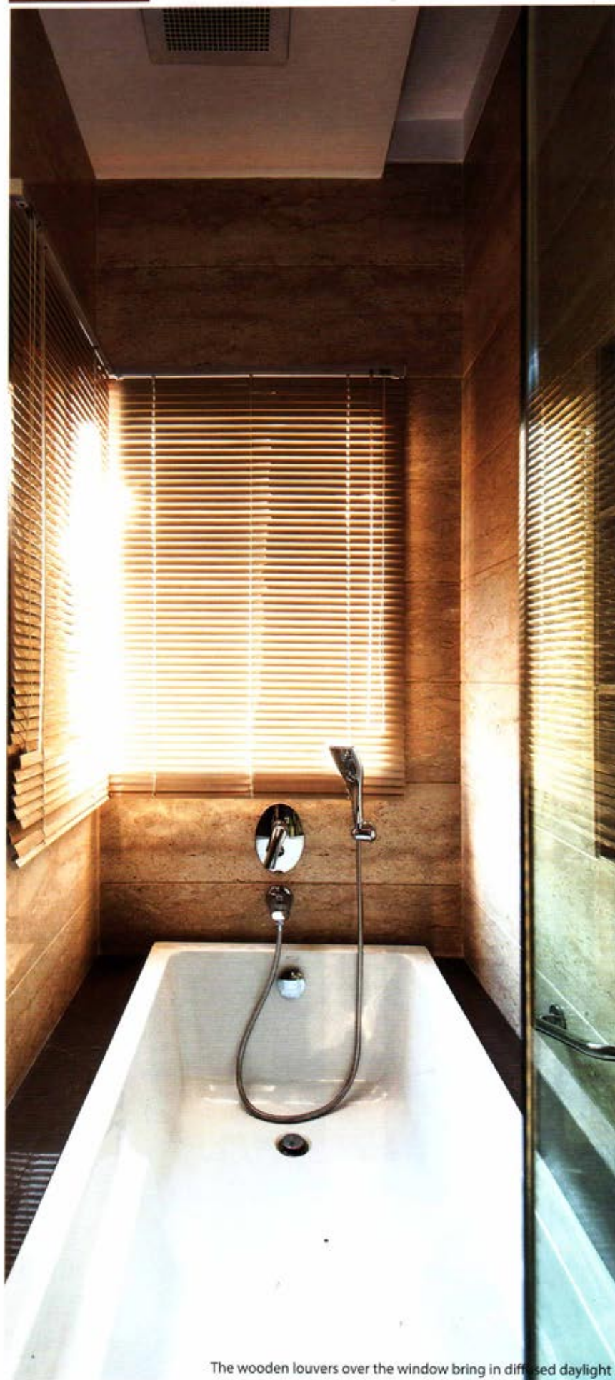
The wooden louvers over the window bring in diffused daylight

This relevant aesthetic also takes into account the now readily available research on the most optimum materials to suit the most specific needs. Extensive walnut paneling on the inside enhances texture. Considering the largely neutral palette that fills the house, this is a tactful move. The renovated house itself is centered around a staircase built of dark wood, in contrast to the lighter paneling. The textures are also playfully carried into several spaces, the beams in the corridor, for instance, and the checkerboard ceiling in the kids' room. Everything was made up along the way, each space tackled as it