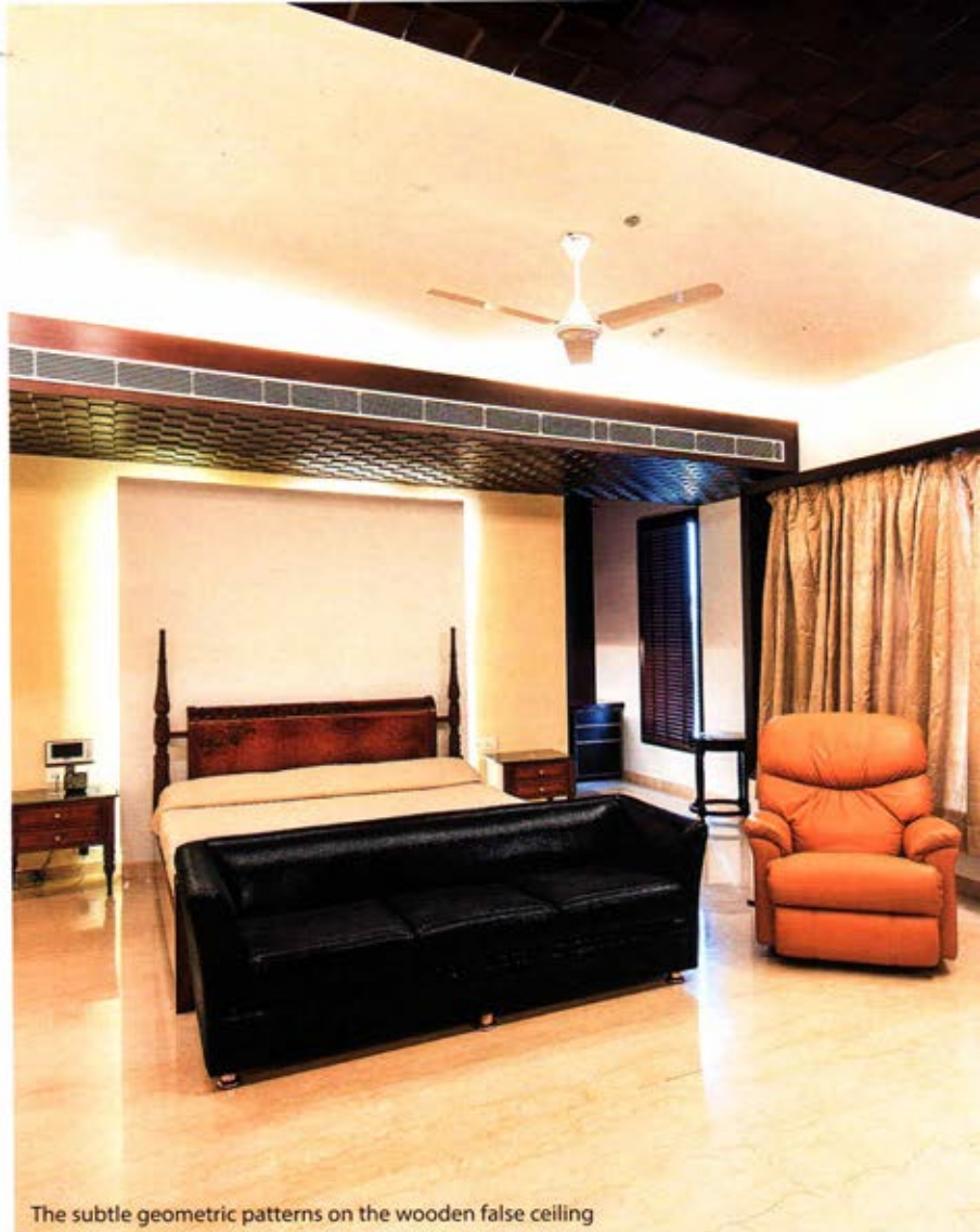
The subtle geometric patterns on the wooden false ceiling

“The buildings we inhabit are inherently soaking in a stew of ecological, cultural, and economic conditions of the region. Not only do the climate and topology of the geography shape our lifestyles, but also networks of access to material, social and personal networks, and logistics”